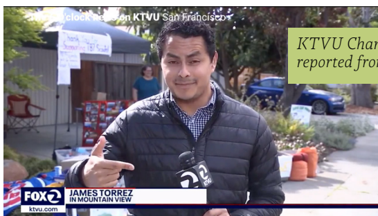
KTVU Channel 2 News reported from Alvin Street