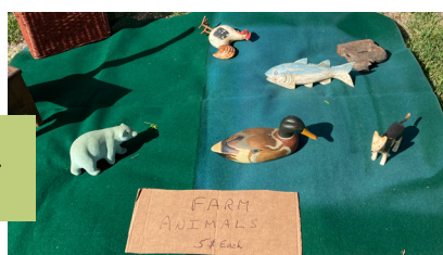
Unique finds and great bargains were around for those who looked.