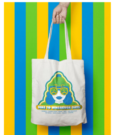
2022 BTWD bike bag

Meet at Rengstorff Community Center, 201 S. Rengstorff Ave., Mtn. View. Meet at 8:45 AM for a 9:00 AM departure for coffee at Peet's Coffee in Menlo Park. Travel at a mild, social, and comfortable pace through residential neighborhoods to reach our destination. After purchasing coffee at Peet's, go to the park across the street to enjoy them. The ride is expected to last about 3 hours returning to Rengstorff Community Center around 11:50 AM.