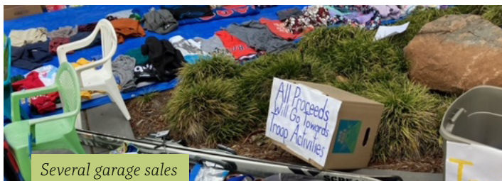
Several garage sales were fundraisers for organizations.

Perhaps because Monta Loma had the most dots on the citywide-sales map, a TV film crew visited Alvin Street. See the footage at tinyurl.com/MLNOnTV .