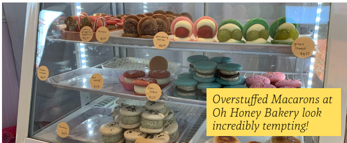
Overstuffed Macarons at Oh Honey Bakery look incredibly tempting!